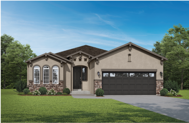
TUSCAN elevation A