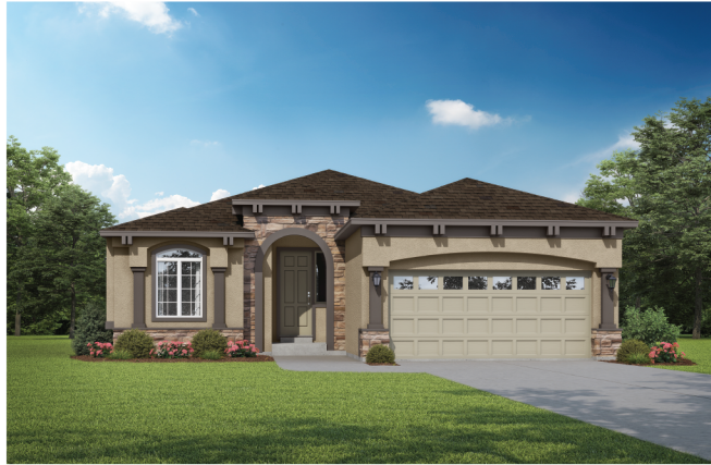
EUROPEAN COTTAGE elevation B