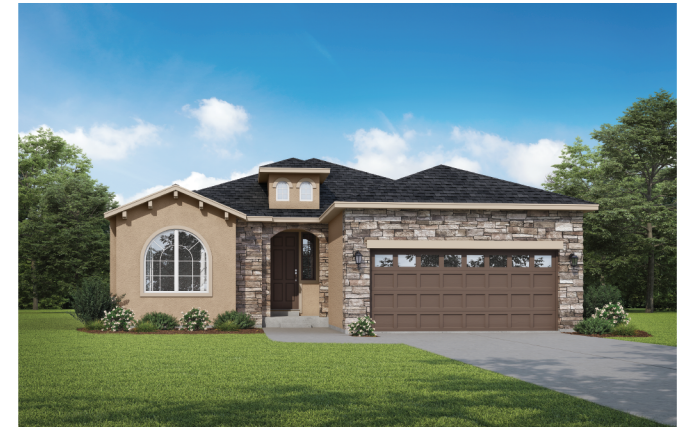
FRENCH COUNTRY elevation C