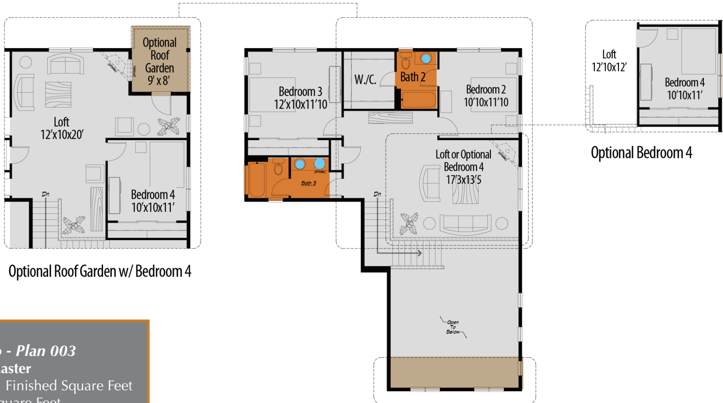
Optional Roof Garden w/ Bedroom 4