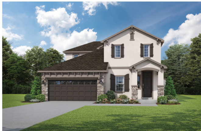
EUROPEAN COTTAGE elevation B