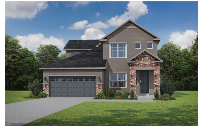
FRENCH COUNTRY elevation C