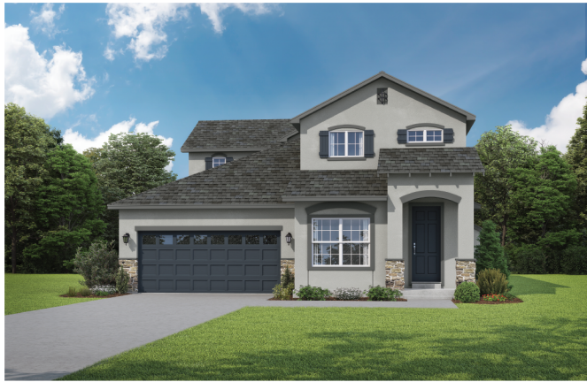
TUSCAN elevation A