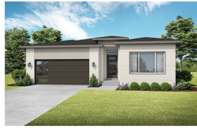
MODERN DESERT elevation D