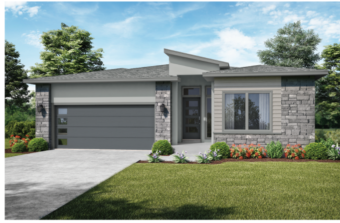
MODERN DESERT elevation D